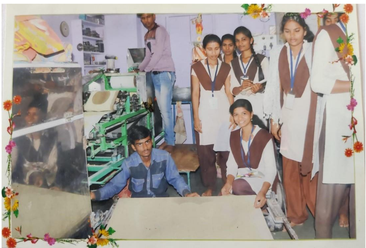
Visit to Anita Gruh Udyog, Nandura (20/03/2018)