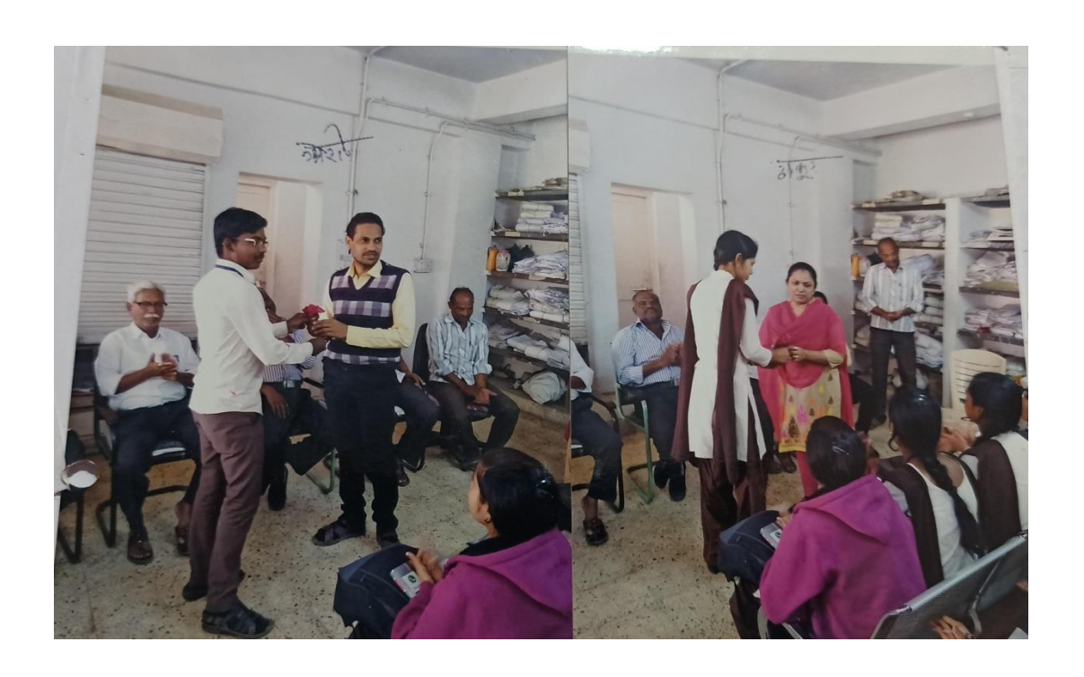
Post office Visit (30/01/2018)