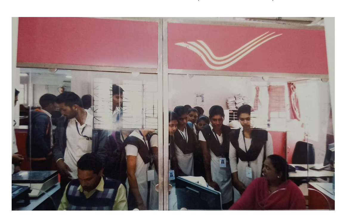
Post office Visit (30/01/2018)