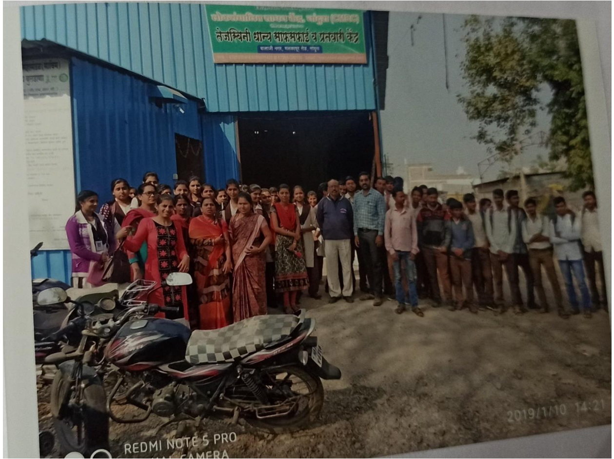
Industrial visit to Tejaswini grain sorting unit on 10/01/2019