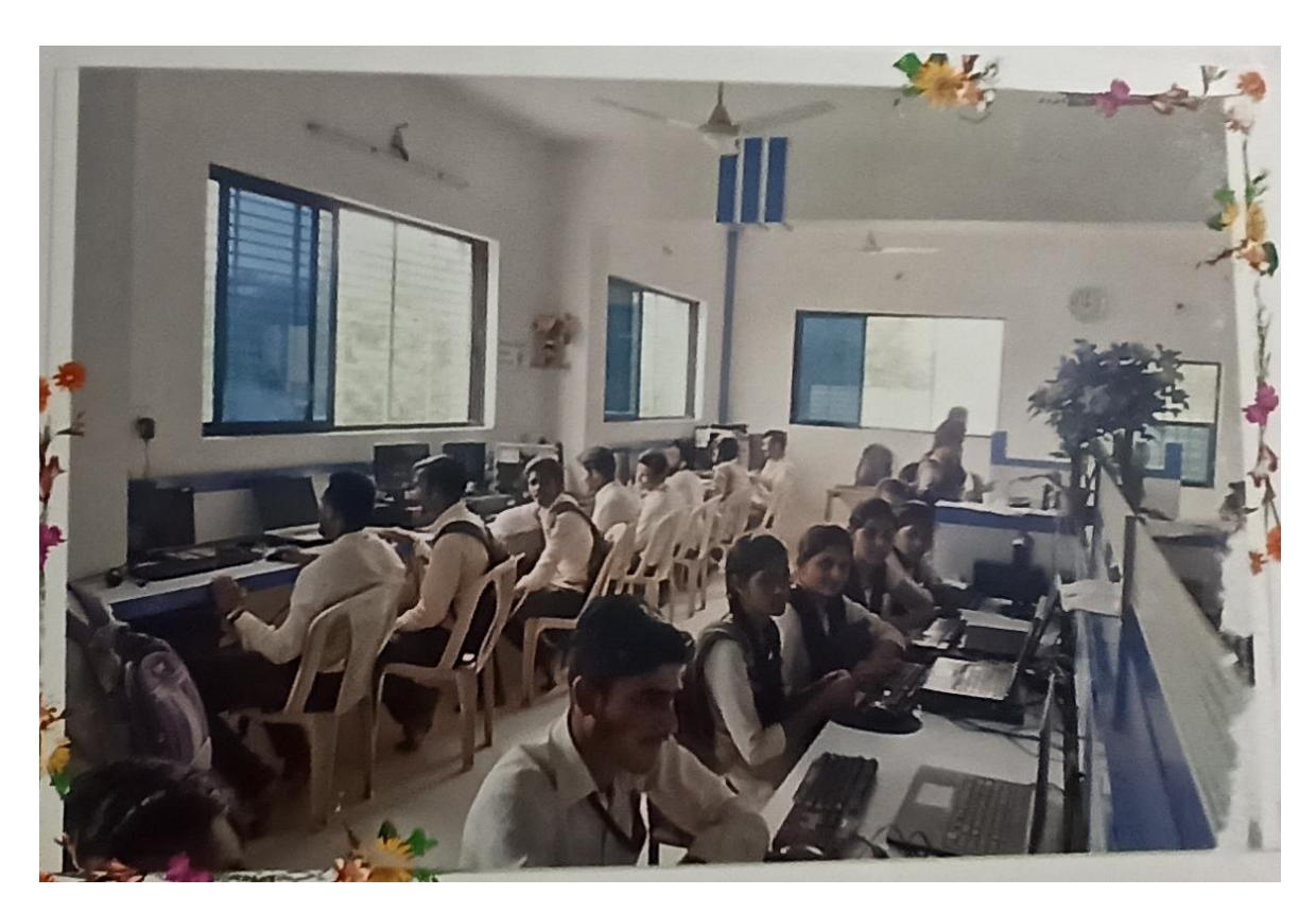
One Week Hands on Training in Computer Applications (19/10/2019-28/10/2019)