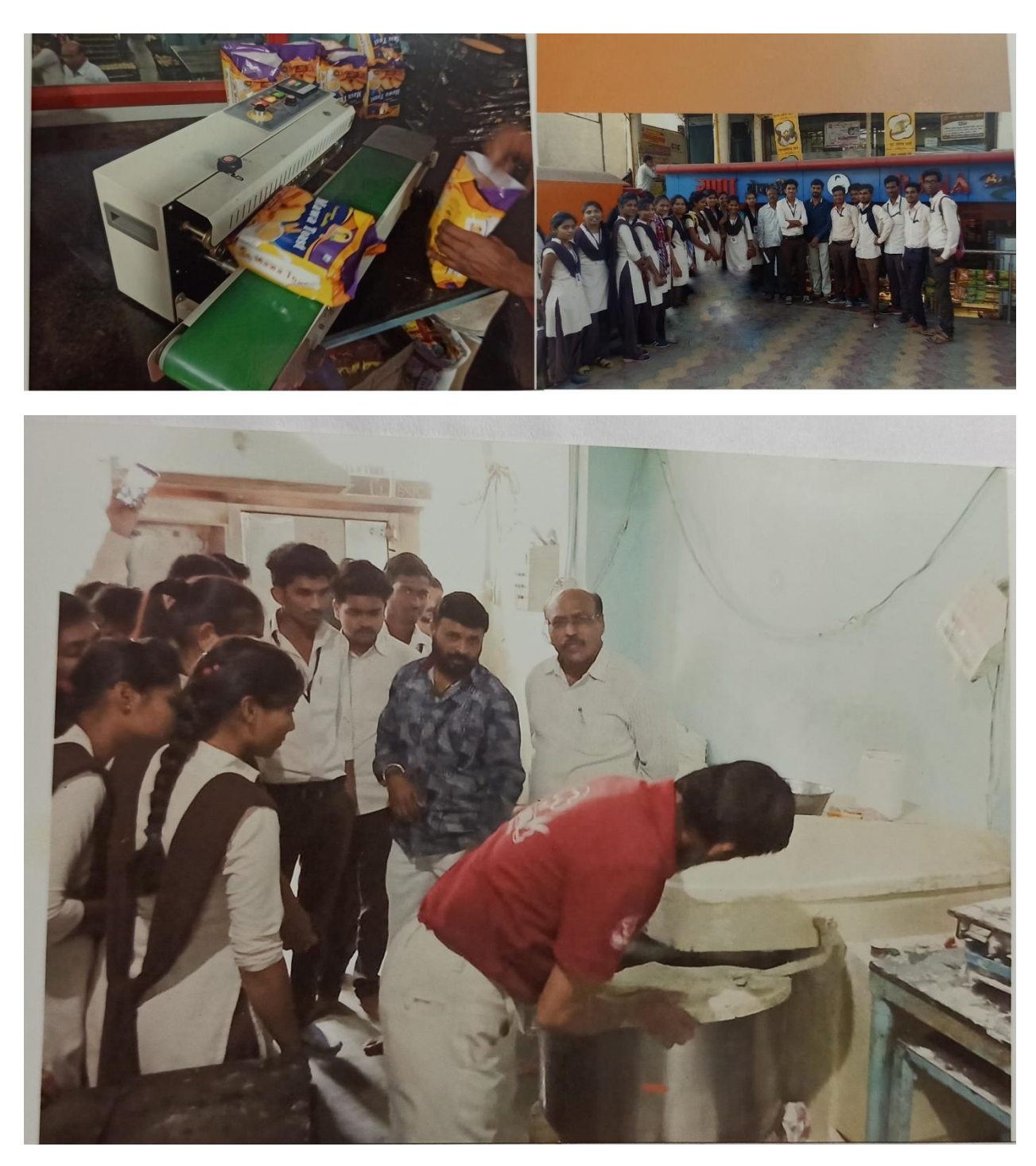
Industrial visit to Rana Food Industries, Nandura. (13/02/2020)