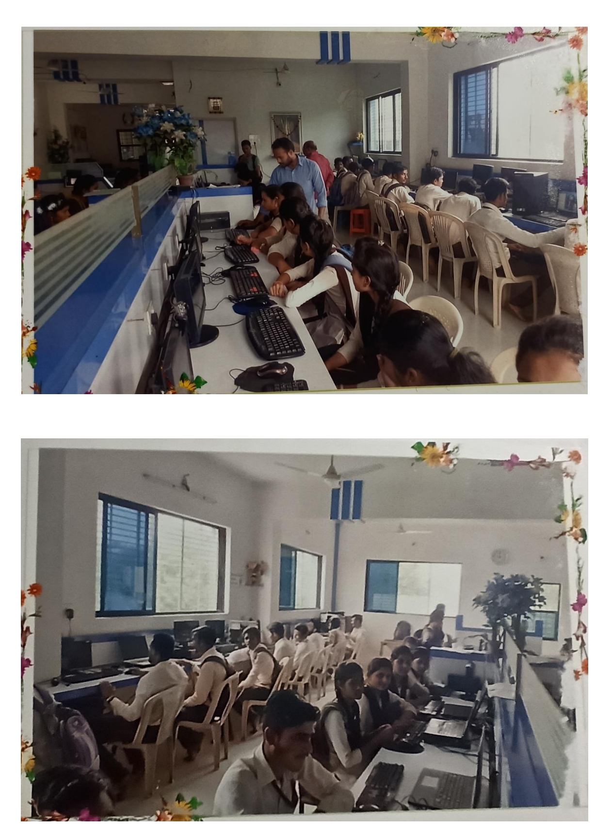
One Week Hands on Training in Computer Applications (19/10/2019-28/10/2019)